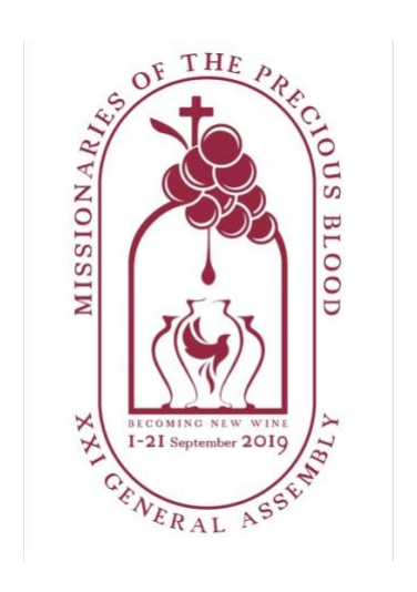
Prayer for the General Assembly

God rewards us according to the purity of our intentions and according to our labors. If the results, at times, do not correspond to our desires and the situation does not depend upon us, we will speak through prayer and through good example. Never should one lose equilibrium in God. (Letter 2819)