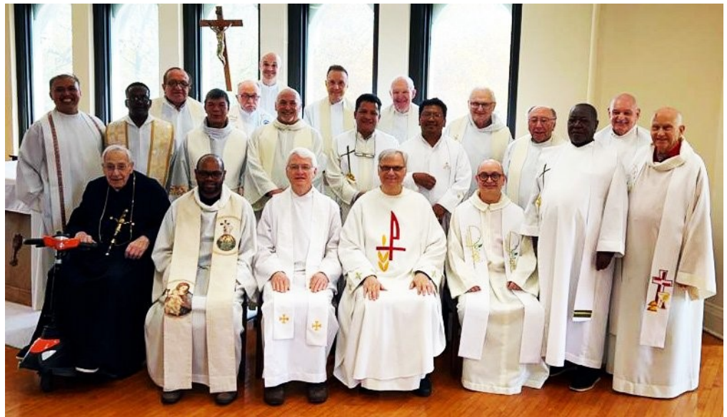
2023 PROVINCIAL ASSEMBLY CPPS members of the Atlantic Province convened in Niagara Falls, Ontario, for this year's Electoral Assembly, from May 1 to 4. We pray for our elected confreres as they embrace their mandate.

A discussion arose as to various possibilities for ministry and location of the members currently serving in the Mexican district. (To be continued)